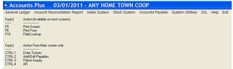
Accounting Main Screen